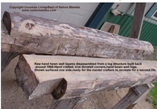
The very beginning of a second life as a mantle.

Here is a basic start to finish photo example of how we do what we do with this mantel design: