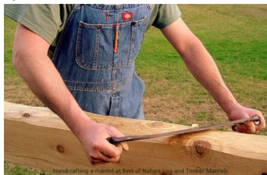
Still Handcrafted with vintage hand tools.